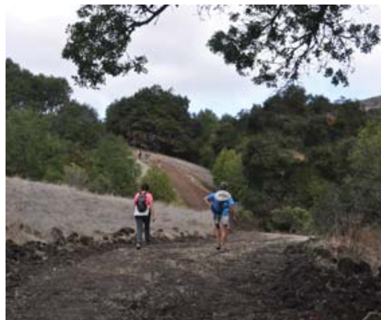
A hiking map for the Carr Ranch loop trail can be found at www.jmlt.org/downloads/JMLT Carr Ranch Trail Map.pdf .

On the Nov. 11 tour, birds were easier to spot than other wildlife. Walking Carr Ranch requires good stamina, or time, in order to climb the heights of the property. It took four hours for those who did the entire hike. They were rewarded by views of the San Mateo Bridge and the bay, the delta area and Benicia Bridge, Tilden Park, or Bollinger Canyon. They spotted numerous birds and a coyote leisurely inspecting his kingdom. The trail is now open to the public; an EBMUD trail permit is required to access the ranch, which can be purchased on the agency's web site.